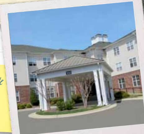
Multi-family homes in Cary

Get your copy of Designing Style: A Guide to Designing with Today's Vinyl Siding at www.vinylsiding.org/design