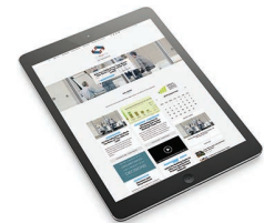
Regular blog and digital newsletters